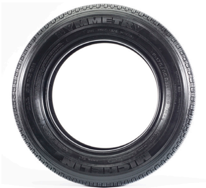
Top: The semiconductor industry relies on accelerator technology to implant ions in silicon chips.

The science and technology of particle physics has contributed to many other areas benefitting the nation's well-being. Simulation of cancer treatments, reliability testing of nuclear weapons, curing of epoxies and plastics, improved sound quality in archival recordings are just a few examples on a growing list of practical applications.